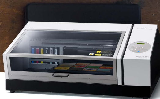
The VersaUV LEF2-200 desktop UV printer