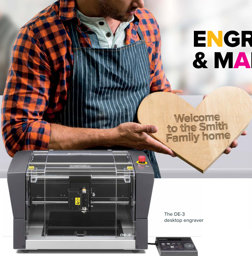
The DE-3 desktop engraver