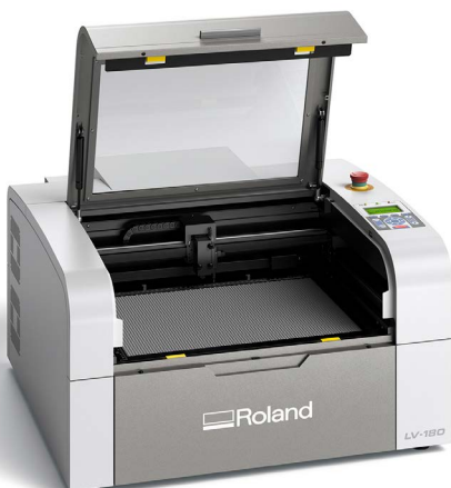
The LV-180 desktop laser engraver

Whether you are looking to launch a new personalisation business or expand into some profitable new applications for your current business, laser engraving machines add so much choice and product diversity.