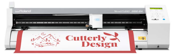
VersaSTUDIO GS2-24 desktop cutter

With Roland DG technology you can quickly and easily print and contour cut full colour heat transfers for short run apparel, to create custom garments such as shirts, jackets and hats, plus all kinds of sportswear with heat applied digital cut graphics, including flock, reflective, neon, glitter and twill.