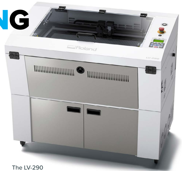
The LV-290 laser engraver

With the Roland DG LV-290 and LV-180 laser engraving machines, you can cut out wood, leather and acrylic, and mark on metal, glass and much more with laser-precise results at the touch of a button. They offer a safe, fully enclosed operation with a non-contact CO2 laser.