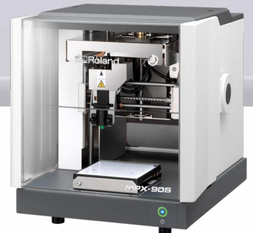
The VersaSTUDIO MPX-90S desktop impact engraver