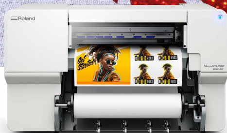
The VersaSTUDIO BN2-20 desktop printer/cutter

With print widths ranging from 515mm up to 1615mm, you can also produce custom window and wall graphics, and unique contour cut labels and decals in virtually any shape or size.